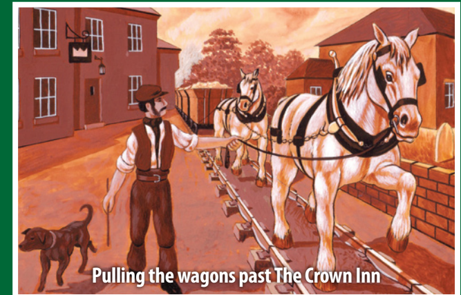
Pulling the wagons past The Crown Inn

These two images depict the mosaics to be found in The Crown Inn car park.